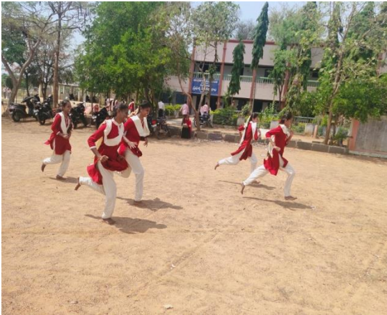
100mts Running Event